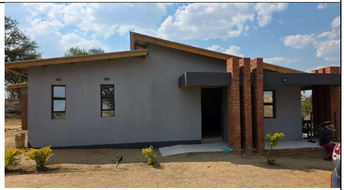
Main Building now Complete