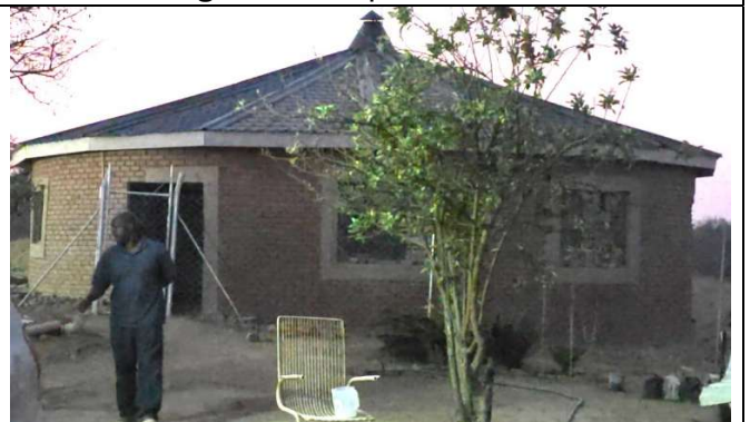
Assembly Room Complete