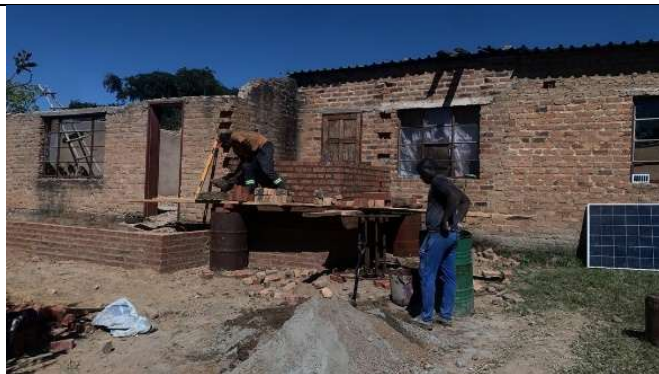
Above: Main School Building under construction