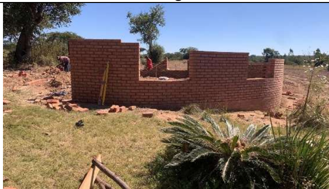
Above: Assembly Room near roof level